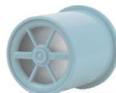
PMV® 007 (Aqua Color™)

It provides patients the opportunity to speak uninterrupted without having to wait for the ventilator to cycle and without being limited to a few words as experienced with "leak speech." By restoring communication and offering the additional clinical benefits of improved swallow, secretion control and oxygenation, the Passy-Muir Valve has improved the quality of life of ventilator-dependent patients for 25 years.