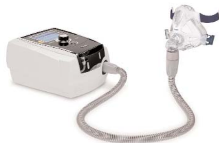
Stellar 100 and Quattro FX

ResMed is committed to developing innovative, effective and easy to use solutions to assist medical professionals in helping to improve the quality of life of patients.