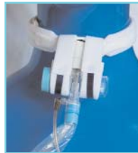
Pepper Medical's Vent-Strap®

HT®70S from Newport Medical Instruments is similar to the HT®70 ventilator but it does not provide pressure support or trends. For equipment specifications, visit www.ventilators.com .