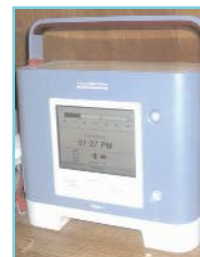
Philips Respironics' Trilogy100

Philips Respironics expands the company's solutions for patients who suffer from chronic respiratory disease with the Trilogy100 ventilator. Trilogy makes invasive and noninvasive home ventilation less complicated with a simplified user interface and Respironics' proven BiPAP technology for greater versatility. Its lightweight design and internal and detachable batteries make portability easier for patients on the go. For more information, go to http://trilogy100.respirionics.com/